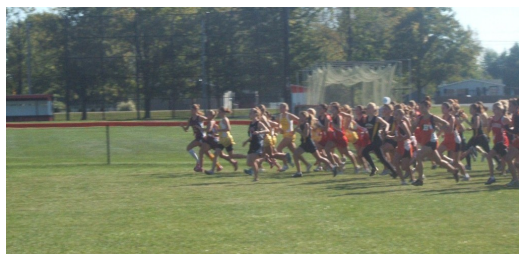
Licking Heights runners lead the pack at the start of the North Union Invitational.

There are no time outs, no benches, and no sissies.